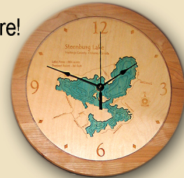
14" Steenburg Lake Clock

Phone 613 337-5067 for restaurant hours, information and reservations..