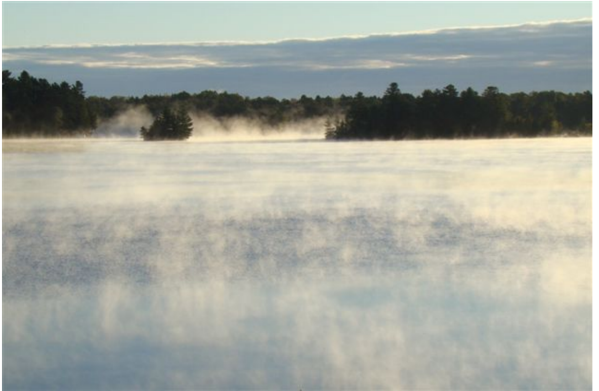
Best in Show & Landscape Winner - Donna Kaye Cochrane